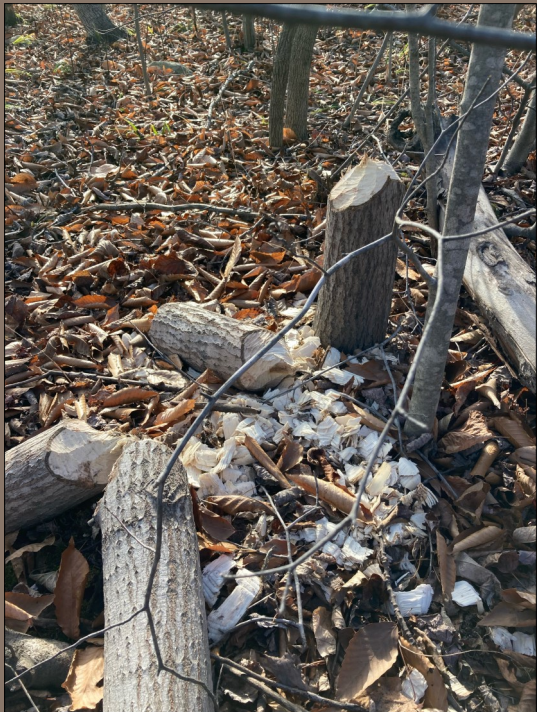
Beavers have been hard at work at Casey Park.